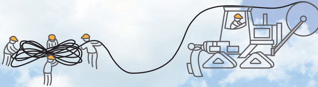
FIGURE 8ING AHEAD OF THE PLOW: Keeps the plow separate from the cable handling process, allowing for more cable to be placed in less time.

THE OLD WAY: Stopping the plow to wait for the cable handling process, decreasing production and wasting time.