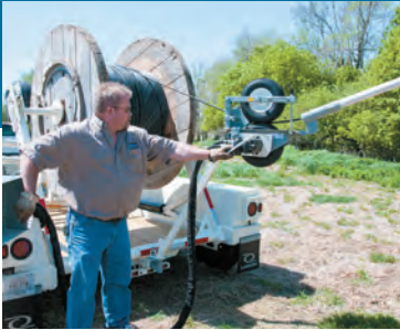
FIGURE 8 ASSEMBLY

The Larson Cable Trailer Figure 8 Assembly reduces the time and manpower needed to figure 8 cable. The trailer will safely figure 8 cable and rewind cable at approximately 700' per minute. We have demonstrated and tested this device with many fiber optic cable manufacturers and it has been approved as a safe method of figuring many different types of cable, including ribbon fiber. The time and labor savings this accessory provides equals a significant increase in production and decreases downtime.