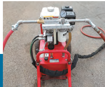
FIGURE 8 STAND

Our Portable Hydraulic Power Pack is modified to power our Figure 8 Device and accepts our manifold for our Fiber Blower. This unit will allow you to blow fiber without the need to be at the trailer. Use it as a stand-alone blower or in a piggyback situation.